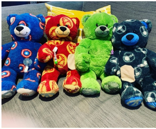
adorable bears for St Mark's Hospital Foundation!