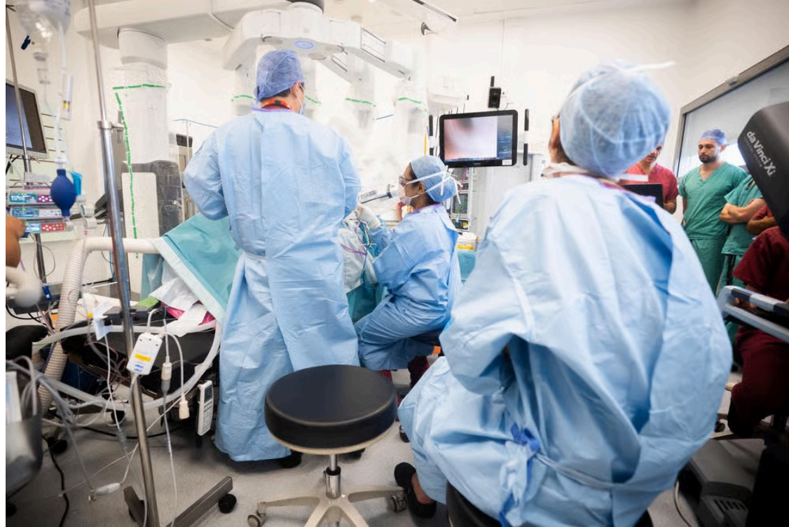
St Mark's surgeons performing a bowel resection using the colour-coded AI overlay of patient anatomy

Mr Sahnan compared the leap to the transition from paper road atlases to modern digital navigation apps—an evolution from static reference to dynamic, moment by moment support. The hope is that such technology will reduce complications, shorten operating times, and improve outcomes across a wide range of procedures. Early use suggests the system can identify structures faster than the human eye, offering a safety net during intricate dissections.